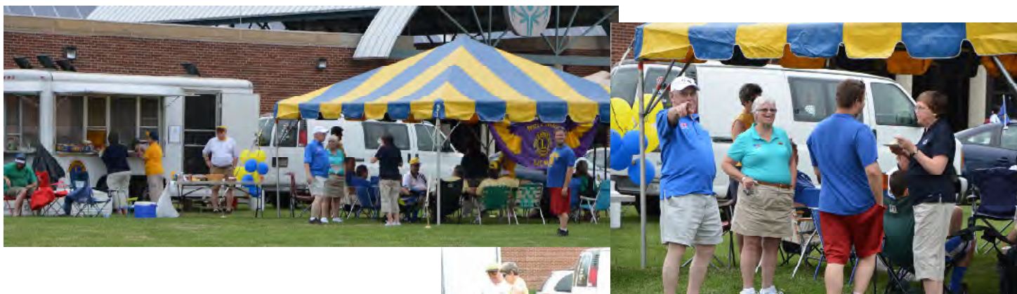
Lions of 22D Tailgate Party before the game