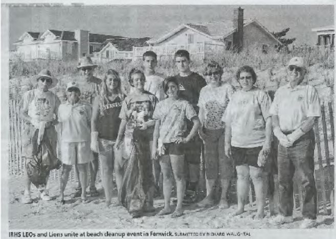
IRHS LEOs and Lions unite at beach cleanup event in Fenwick.

"It may be a lot of work at times, but making a difference to those in need is the best feeling in the world."